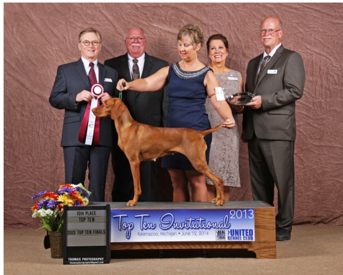
Multiple BIS GCH UKC/GCH AKC Solaris Sweet Tart Top Ten All breed at the UKC Premier Finals