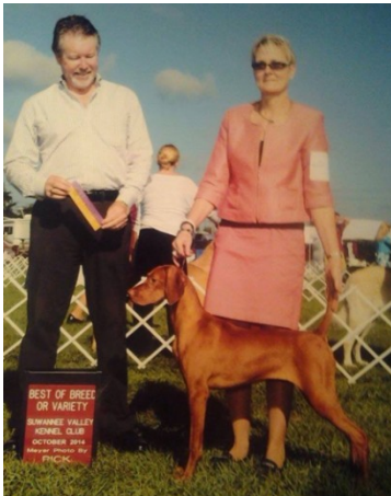
UKC Ch Solaris Pants On Fire goes RBIS from the puppy class to finish. Wins BOB first time out.