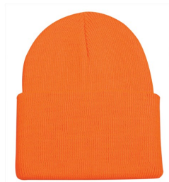
Watch Cap with Cuff

COLORS: White, Light Steel, Deep Forest, Light Blue, Deep Royal, Pale Pink MEN'S SS, WOMEN'S SS CREW NECK also available in Vintage Khaki, Vintage Green