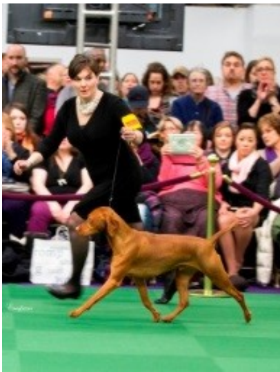
BISS Silver GCH Solaris Tuzes Paprika JH CGC Select dog at Westminster Kennel Club