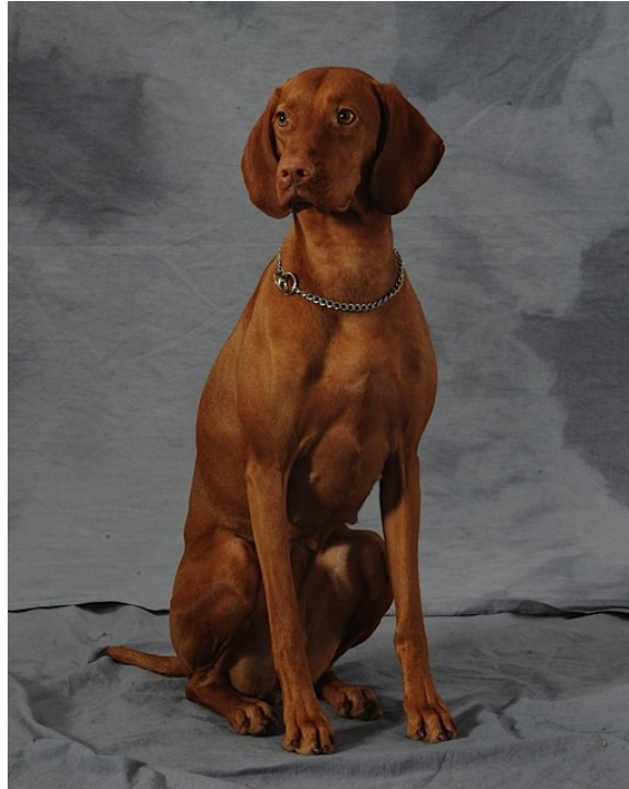
Solaris Sweet N' Sassy CD, BN, PCD, RE, JH, OAJ, NF, CGC earns her OAJ & NF