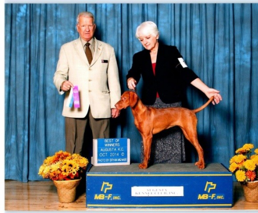
Solaris Elgin Femme Fatale pointed from the puppy class