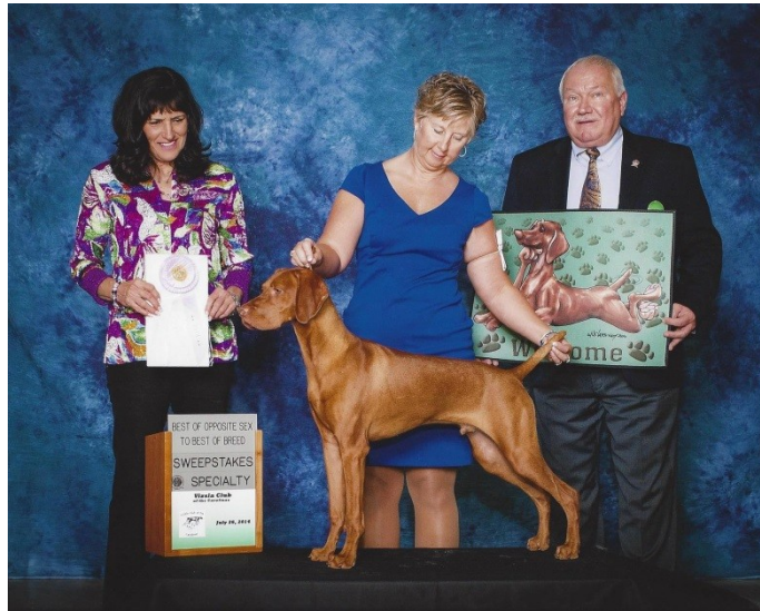
Solaris Lucky Penny (ptd) makes his debut in style